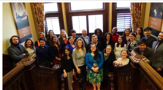
2015 OTA Winners

The Graduate School is pleased to announce the 29 th annual awards program recognizing Outstanding Teaching Assistants. This program was instituted to recognize Teaching Assistants who have made distinguished contributions to Syracuse University by demonstrating excellence as primary instructors, lab or studio instructors, discussion/recitation section leaders, or assistants to faculty members for high-enrollment courses. Nominations for the OTA are put forward by the departments and programs, so if you would like to be considered, please inquire with your department regarding the nomination process. The nomination deadline is Friday, January 29, 2016.