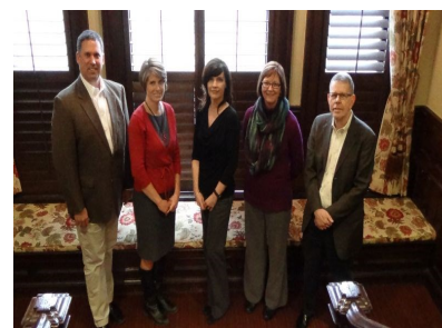
2015 EGE Winners

Is there an outstanding professor you would like to honor? Let us know! The Graduate School is currently accepting nominations for the annual Excellence in Graduate Education (EGE) Faculty Recognition Award, designed to honor exceptional graduate educators here at SU. Awards will be made on the basis of the nominees’ mentorship, graduate-level teaching, career advisement, and advocacy efforts on behalf of grad students.