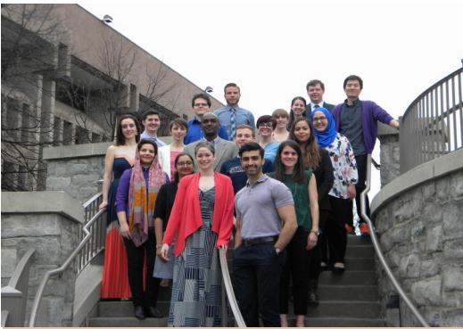
2016 OTA Winners

The Graduate School is pleased to announce the 30 th annual awards program recognizing Outstanding Teaching Assistants. This program was instituted to recognize TAs who have made distinguished contributions to Syracuse University by demonstrating excellence as primary instructors, lab or studio instructors, discussion/recitation section leaders, or assistants to faculty members for high-enrollment courses. Nominations for the OTA are put forward by the departments and programs, so if you would like to be considered, please inquire with your department regarding the nomination process. The nomination deadline is Friday, January 27, 2017.