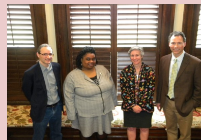
2016 EGE Winners

Is there an outstanding professor you would like to honor? Let us know! The Graduate School is now accepting nominations for the annual Excellence in Graduate Education (EGE) Faculty Recognition Award, designed to honor exceptional graduate educators here at SU. Awards will be made on the basis of the nominees’ mentorship, graduate-level teaching, career advisement, and advocacy efforts on behalf of grad students.