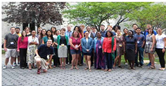
2016-17 Teaching Mentors