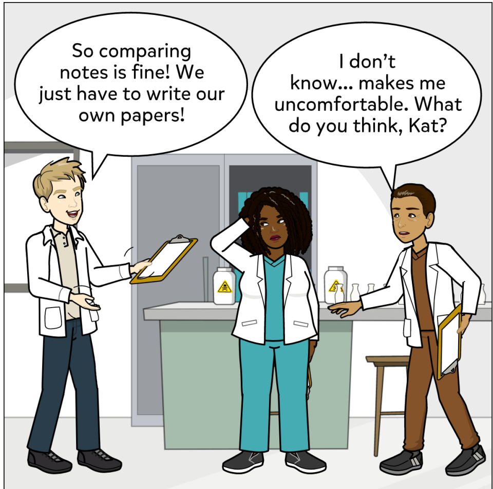
Made with Pixton